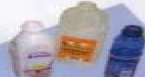
#1-7 Plastic Bottles

Clean, balled aluminum foil 12" or larger and pie pans